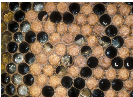
Brood showing EFB, note twisted, discoloured larvae

As you can see from the chart above there has been a significant increase in the numbers of apiaries found to be infected with EFB in the London area. This does have to be viewed against the fact that this year more inspections occurred in this area compared to 2016 and 2017. I would, however stress that it is important to do regular bee disease inspections of your colonies in the active season and contact your local Inspector if you have any concerns.