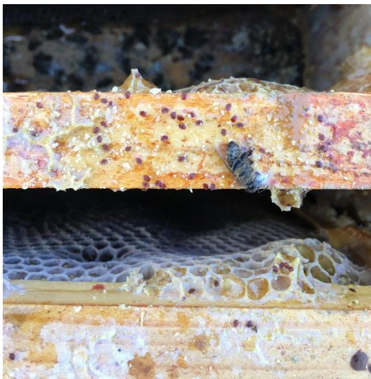
Varroa on top bars of a dead colony

You may also wish to consider using bio-technical methods of control throughout the season. See www.nationalbeeunit.com for more information. If you are using medicines then do follow the manufacturer's instructions, again we have seen colonies lost due to incorrect usage of these products.