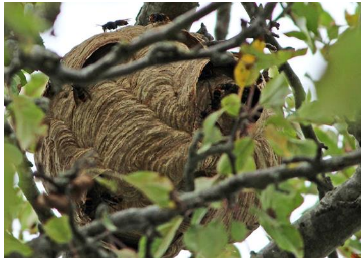
Gosport nest in apple tree