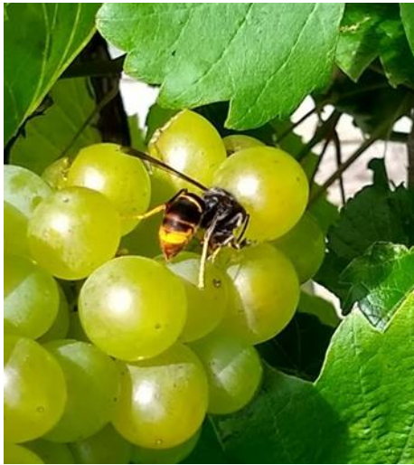
Asian Hornet feeding on grapes

are the damp and variable temperatures between January and March this year making the over wintering queens more susceptible to fungal attack, and the reduction in traffic from France, due to Covid-19 restrictions, reducing the number of founding queens hitching a ride over from the French mainland in the spring.