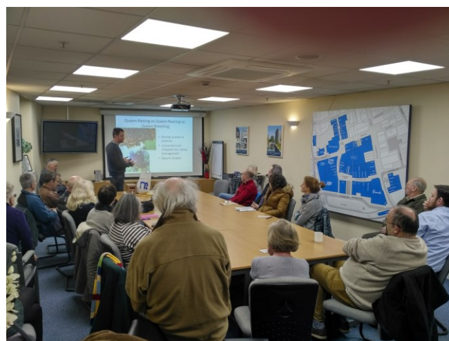
A full meeting room discussing Queen rearing at our February meeting