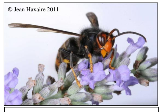
Asian hornet, Vespa velutina nigrithorax

incursion of this exotic insect and will be much surprised if it is not confirmed in the coming season.